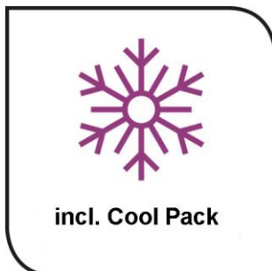
incl. Cool Pack