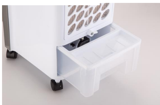
Extractable Watertank 4,5l