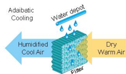
Air Cooler Operating Principle