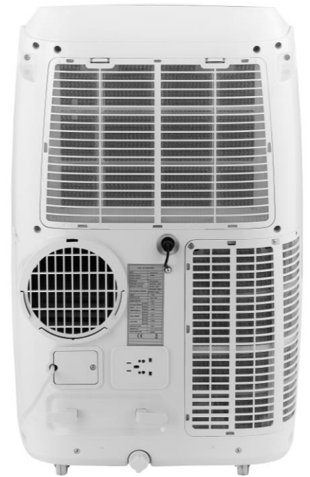
Exhaust air hose connection 150 mm hose diameter