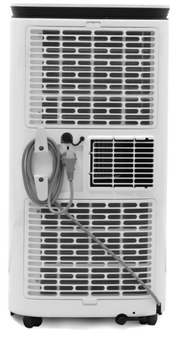
Exhaust air hose connection