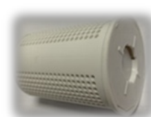
Limescale filter (included in delivery) Art.no. BCKALKF002