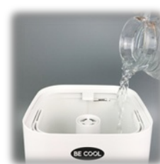
Refill from above, removable tank