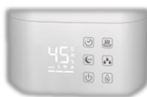
The LED display shows all functions