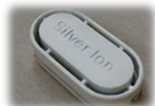
ION filter (included in delivery) Art.no. BCIONF003