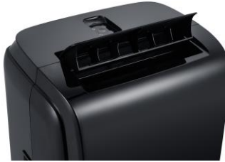
Air outlet and remote control shelf