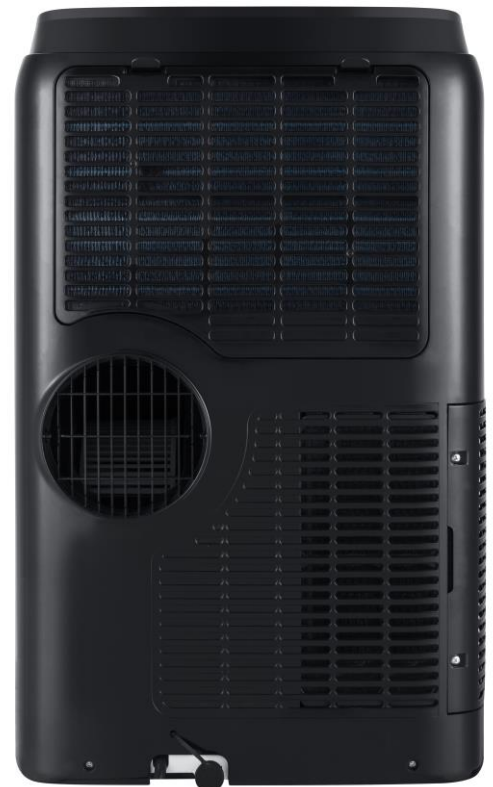
Exhaust air hose 150 mm hose diameter