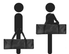
Examples of wear