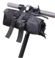
Attachment to the scooter