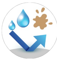
Water and dirt repellent