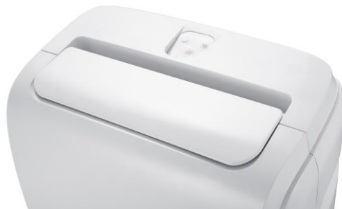
Air outlet and remote control shelf