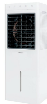
Oblique view left