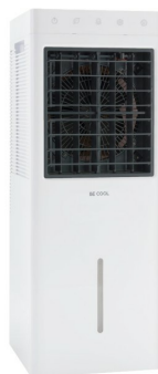
Oblique view right