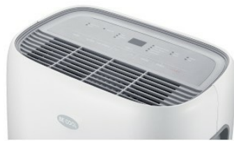
Detailed view top side