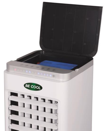
Water tank can be filled from above