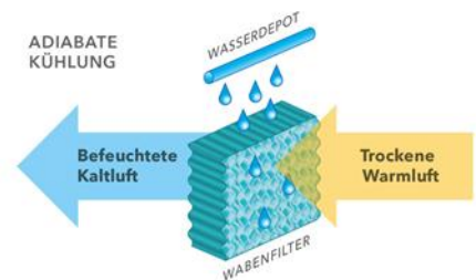
Air Cooler Operating Principle

The Art. No. for your suitable replacement filter is the F-BC6AC2001FTL