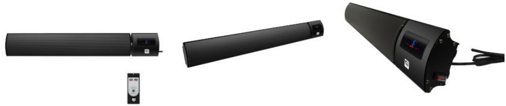
Front view with remote control