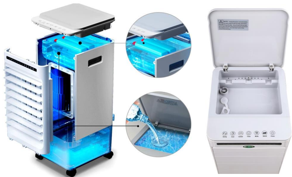
Water tank can be filled from above

In addition to cooling the air, this air cooler differs from conventional fans in that the air is humidified and cleaned. After the summer season, the unit can be conveniently used as a humidifier.