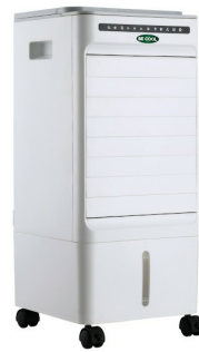
Oblique view right