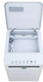
Detail view top side