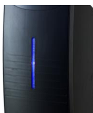
Water level indicator