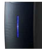
Water level indicator