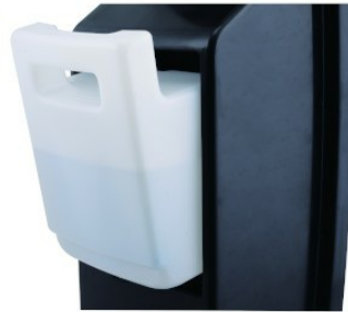
Detail view water tank