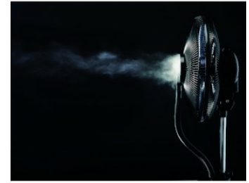
View spray function