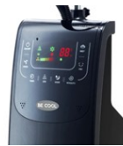
Display and control panel