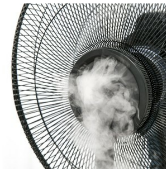
Detail view spray function