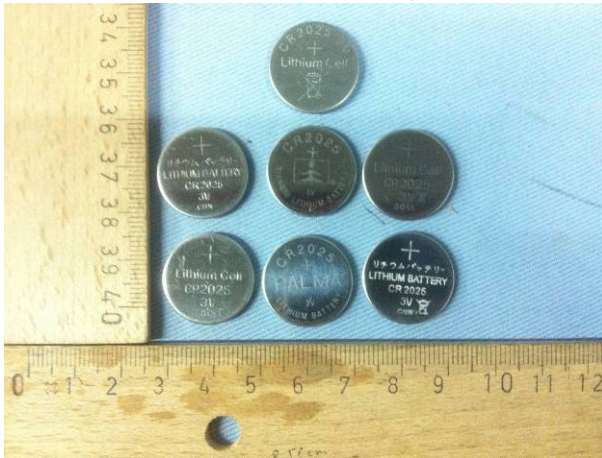
Battery/电池 CR2025 3,0V 150mAh