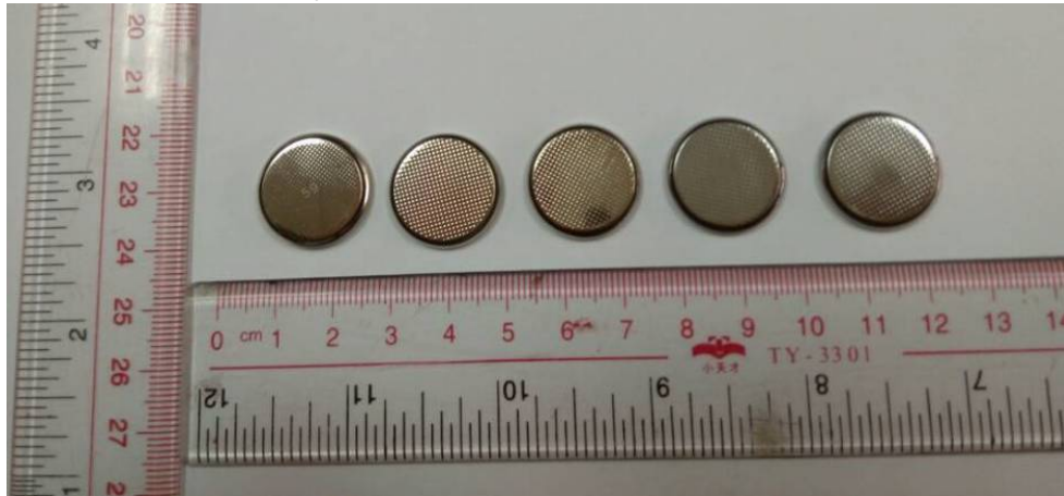
Battery/电池 CR2025 3,0V 150mAh