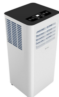
Oblique view 2