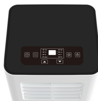
Detail view top side