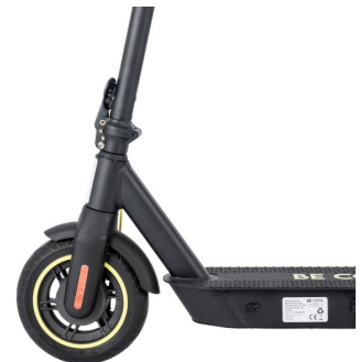
Detailed view front wheel lateral