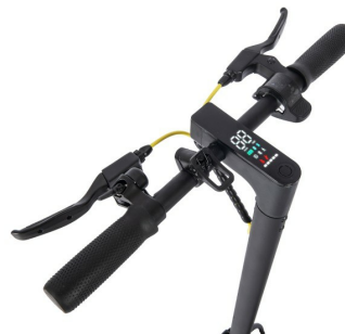
Detail view handlebar