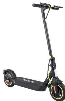
Oblique view right