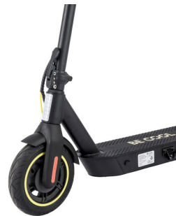
Detailed view of front wheel oblique