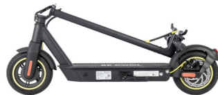
Side view folded