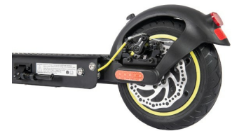
Detail view rear wheel