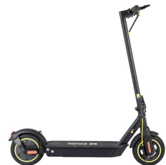
Side view right