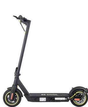
Side view left

The BE COOL eSC-Hi2 has suspension on the rear wheel. This offers maximum riding comfort and the 10" Honeycomb tyres glide over many a bump. The scooter has a drum brake at the front and a disc brake at the rear wheel.