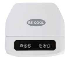
Detail view top side