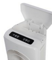
Detail view water tank