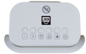
Detailed view of control panel