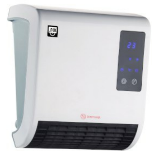
Oblique view left