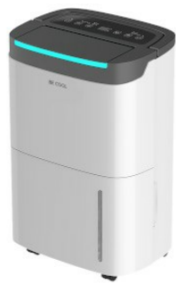
Oblique view right