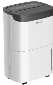
Oblique view left