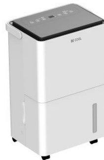
Oblique view #1