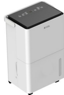
Oblique view #2