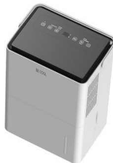
Oblique view top side