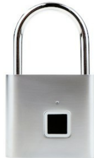
Front view in standby