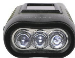
Detail view LED