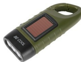
Oblique view #2