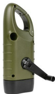
Rear view - crank