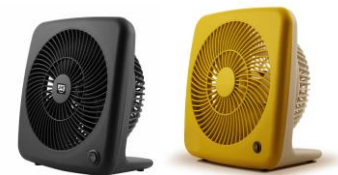
More colors available