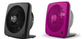
More colors available