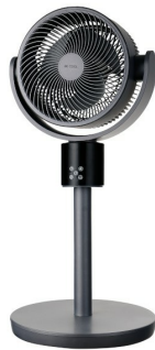
Angled view, height-adjusted