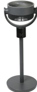
Front view - fan head upwards