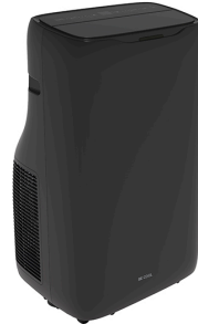
Oblique view left