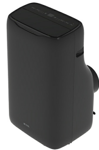
Oblique view right