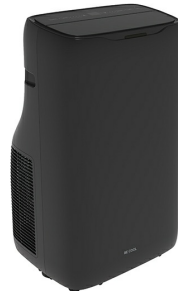
Oblique view left