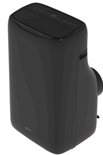
Oblique view right