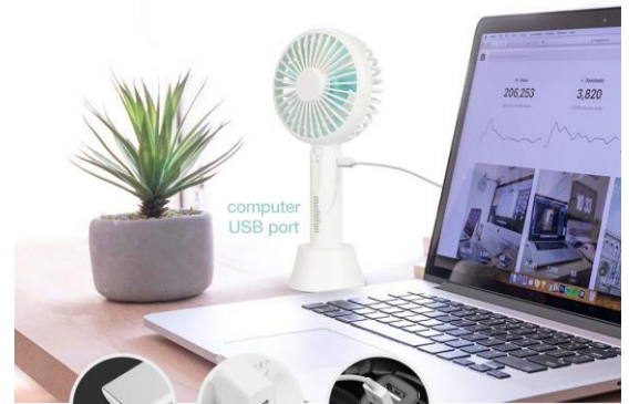
power bank power adapter in-car USB