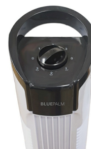
Detail view top side