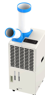
Oblique top view